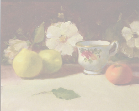
Time for Tea, 8x10, Oil