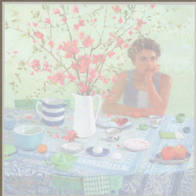
(ABOVE LEFT) TONY ARMENDARIZ (b. 1964), Feeding Nairobi , 2020, watercolor on paper, 18 x 24 in., private collection (ABOVE RIGHT) AIMEE ERICKSON (b. 1967), Something to Think About , 2019, oil on canvas, 30 x 30 in., private collection (BELOW) NARELLE ZELLER (b. 1978), Bury Me with a Mandarin , 2018, oil on ACM panel, 23 3/5 x 31 1/2 in., 33 Contemporary Gallery (Chicago)