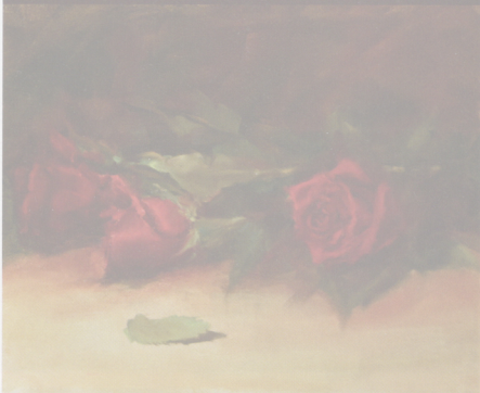
Roses, 8x10, Oil

Member of the prestigious Salmagundi Art Club, National Arts Club, the Players Club, and Portraiture Society of America.